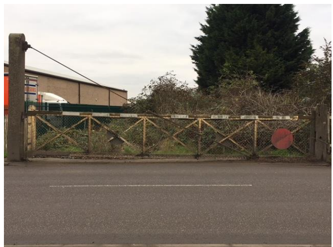
Newbridge Lane, track just visible, looking north.....towards.....Weasenham Lane crossing gate.

Waldersea Depot, Long Drive, Waldersea, Friday Bridge, Wisbech, PE14 0NP