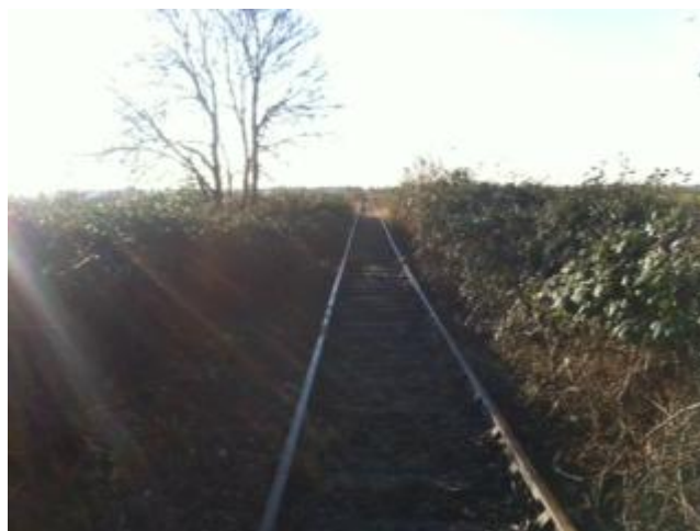
Cleared track heading out towards March from Waldersea

For 2013, the Bramley Line is focusing on the development of a Heritage Site at Waldersea , primarily with the start of the carriage restoration project. Alongside this, the direction and formulation of the business plan as a first move towards obtaining a Transport Works Order is on the agenda.