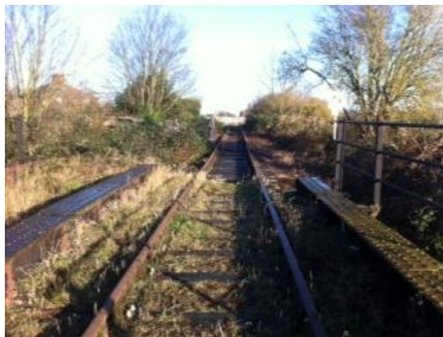
Approaching Waldersea depot from March

We mentioned arranging monthly working days . It has been decided to try this on the second Saturday of each month, working from 1100-1600hrs, or earlier if you are keen. For anyone travelling any distance who is interested in getting involved, you may want to consider stopping over and working on the Sunday as well. It would make it worth the journey, and get a lot more done. We propose to start this on the 9 th March , subject to workable weather conditions. Please contact us, either by email or phone, if you can help. Suitable railway orange hi viz clothing will be necessary for this work, this and safety footwear can be obtained from McIntosh's of Norfolk Street, Wisbech if needed.