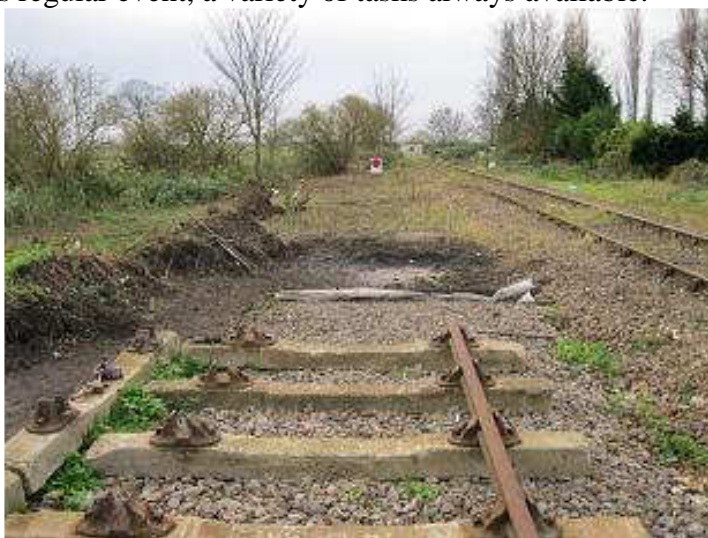
The next stretch of siding under construction.

In addition to work put in by our local members on a regular basis, our second Saturday in the month working days are continuing to attract members from further afield. If you need some exercise in the fresh air, this is an excellent way to get it, and some of us may need to shed some seasonal excess by January. During the winter months, we will always be keeping an eye on the weather forecast, but all being well, will continue this regular event, a variety of tasks always available.