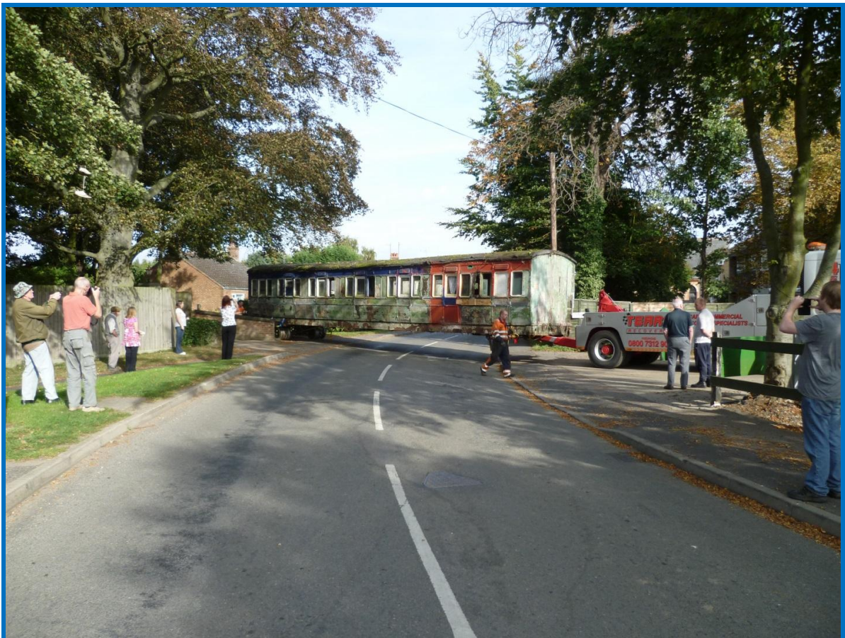
The carriage is seen here creating considerable local interest at the start of its long journey north.

Currently, the Trust is investigating other heritage opportunities at several local sites, whilst we support, and await, the outcome of the ongoing feasibility studies into our own line.