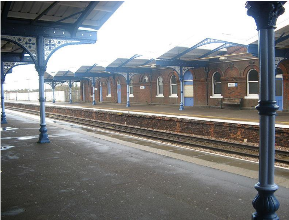
View of March Railway Station, Platform 2.

November 21 st /22 nd Shoeburyness Model Railway Club (Southend Leisure Centre).